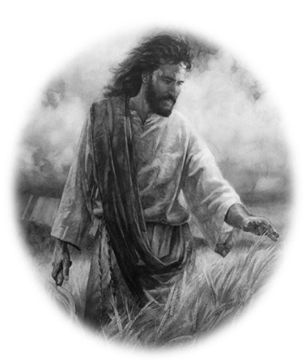
LORD of the Harvest (Wheat & Weed's), Matt. 9:38

Shiloh Ministries is one of The Lord's many Ministry tools to reconcile men for restoration. We are blessed to be used of Him to preach the un-searchable riches that are in Christ Jesus (Eph. 3:8). Everyday we are hearing such wonderful testimonies of our Graduates pursuing their calling of a Godly husband, father, missionary, Staff person at local Churches and a minister of reconciliation in the work place. We are asking that you prayerfully consider financially supporting Shiloh Ministries every month. The Lord's ministry at Shiloh has always been financially free for the man who desires freedom from his addictions. Because of this, we simply trust The Holy Spirit to lead people to give financially. This ministry is grateful to those who express gratitude to God by co-laboring with us in discipleship. The expenditures are huge managing a campus that houses over 30 students, staff & interns. Please prayerfully consider Shiloh Ministries every month as good ground for your financial seed. We invite you to visit our web-site and read our Testimony section. It bares witness of our graduates fruit that is on display, for The Glory of God.